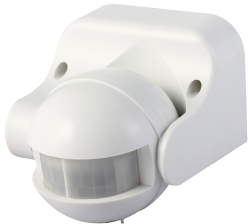
MODEL : HC - 7D

HC-7D sensor switch can detect the infrared Rays released by human body motion within the Detection area, then start the load-light automatically.